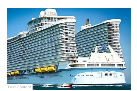
Empty Antarctica Cruise Cabins Cost Almost Nothing (Take A Look)