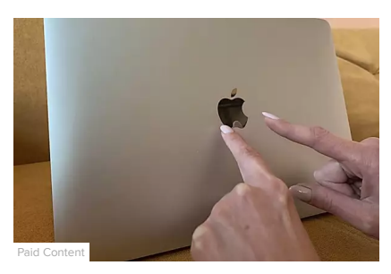
Mac Users Didn't Know This Simple Trick To Block All Ads (Do It Now)

Removing ads is the first step in having a faster, safer and hassle-free browsing... Safe Tech Tips