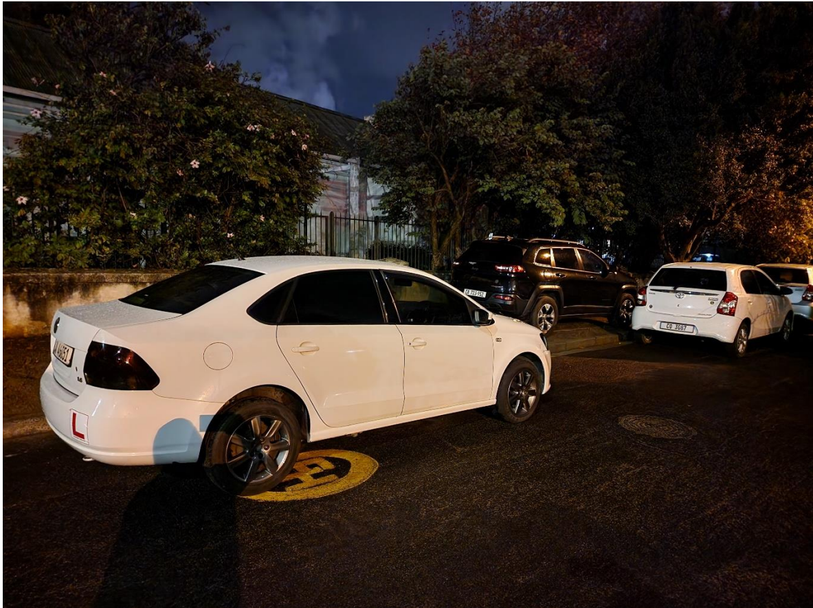
Blocking access across our driveways