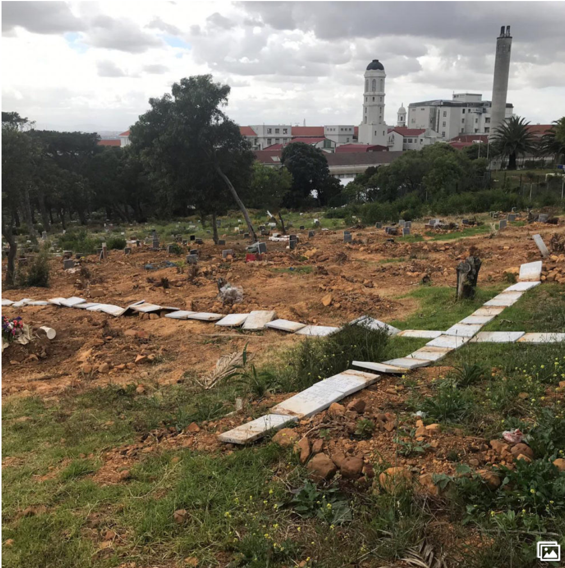
📷 Approximately 70 tombstones from the Mowbray Muslim cemetery in Cape Town were desecrated on 30 October, with some placed in the shape of a cross.

On Thursday there were family members milling around, looking at the tombstones resting against the cemetery walls. (The original scene was documented before workers moved the headstones so family members would not see them laid out).